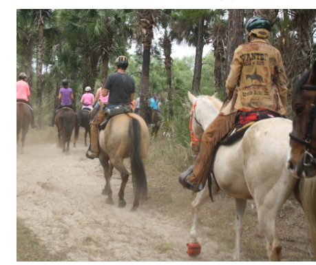
2017 Hoof & Hike participants off to the races!

They are great teachers and partners for all participants. For many of the horses, this is their last job in life – helping others. Without them, there would be no equine-therapeutic activities. The Hoof and Hike supports