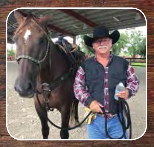
The Scene at NTRC